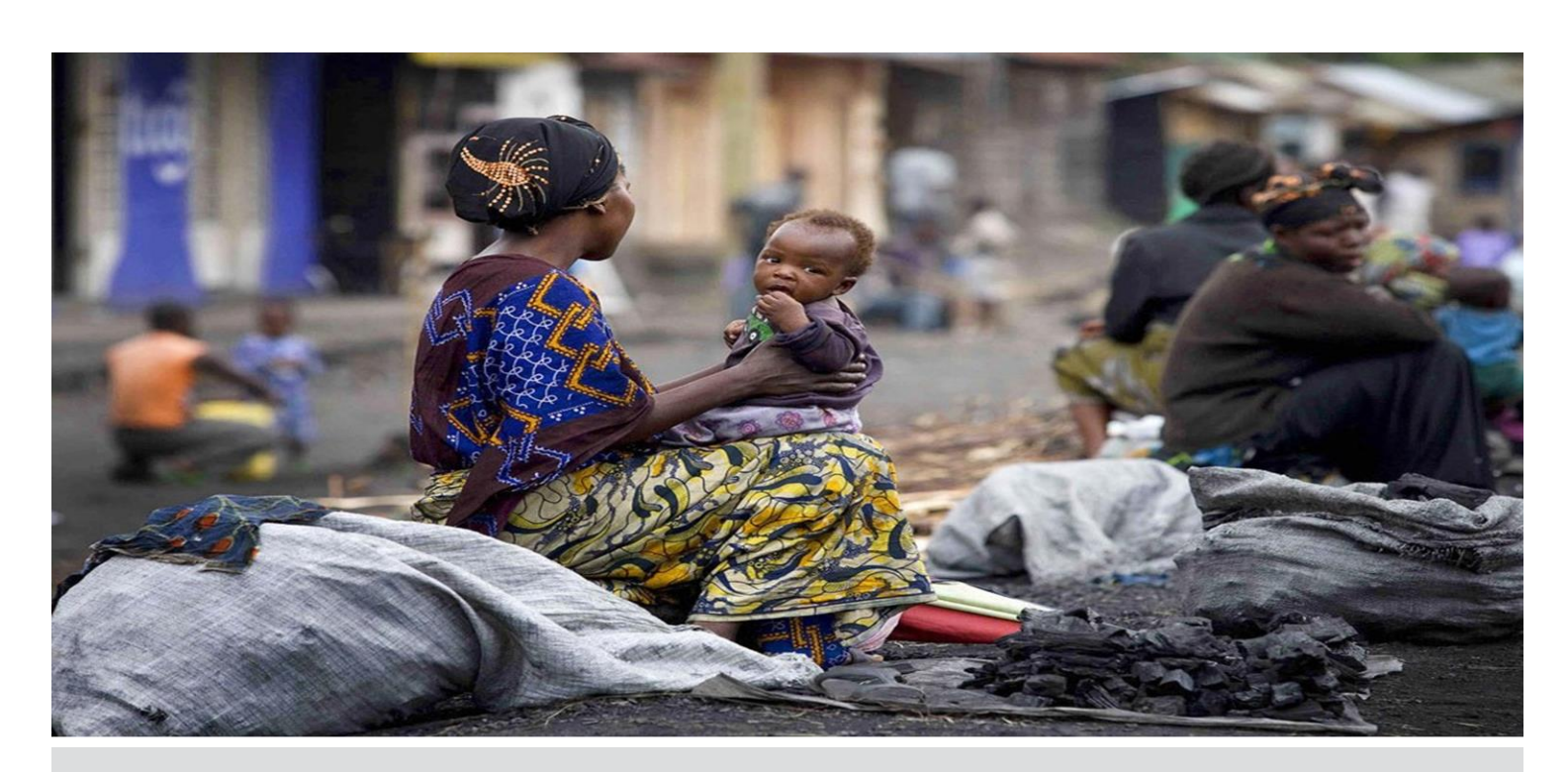
DEMOCRATIC REPUBLIC OFTHE CONGO – 2008: Woman selling charcoal in market near Virunga National Park.