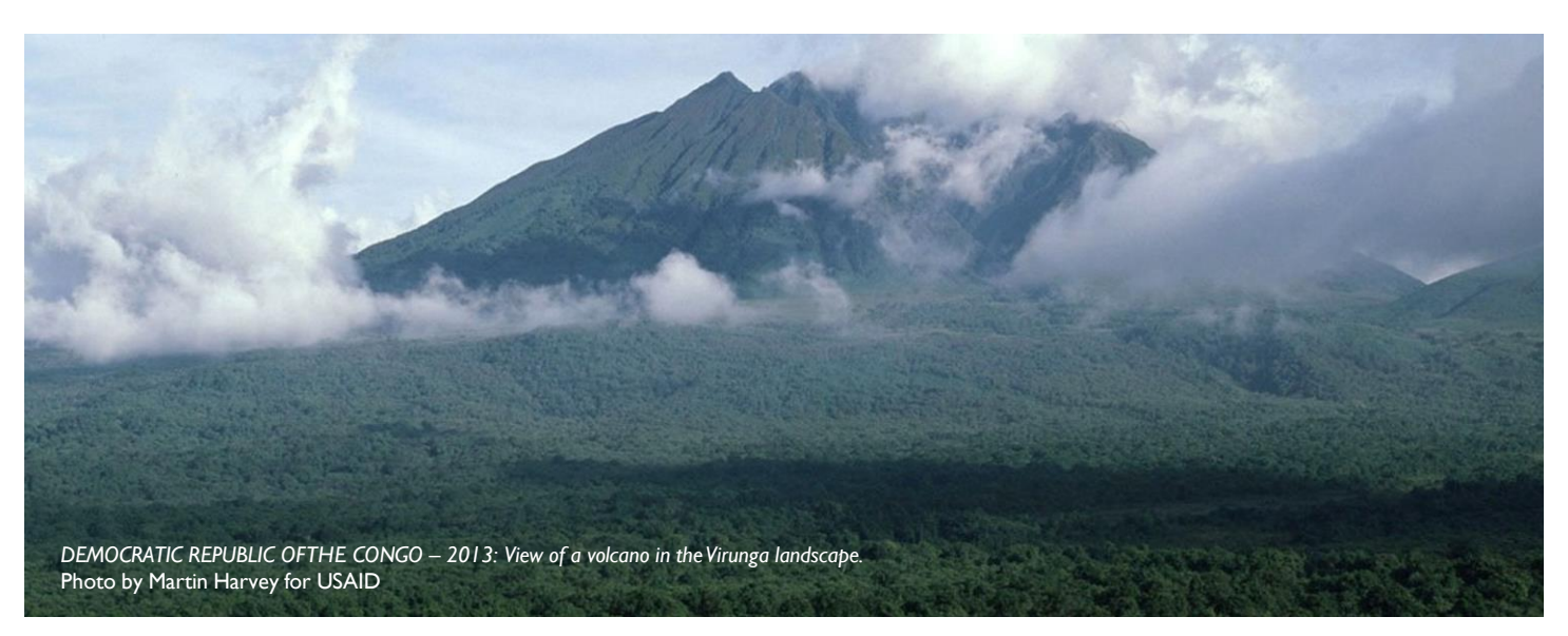
I Spatial Monitoring and Reporting Tool

Potential flashpoints for conflict are reduced by working with local communities to demarcate agreed boundaries. This participatory process, which has been in effect since 2003, is helping to resolve potential disagreements before they start by clearly differentiating between protected areas, community managed land and other land.