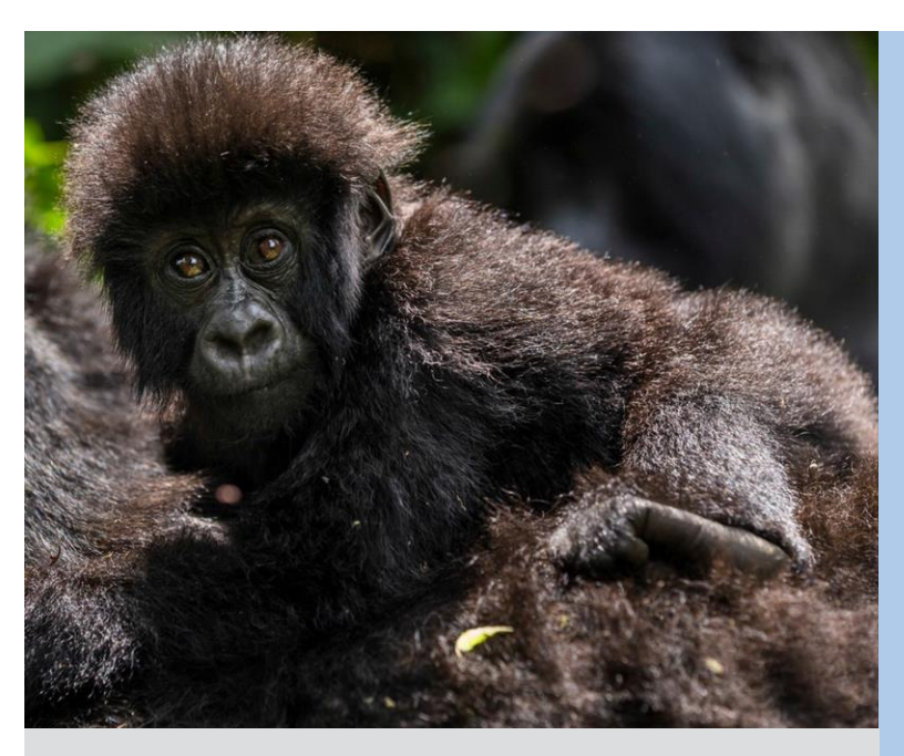
DEMOCRATIC REPUBLIC OFTHE CONGO -2013: A new member of the Bageni family in the gorilla sector of Virunga National Park.