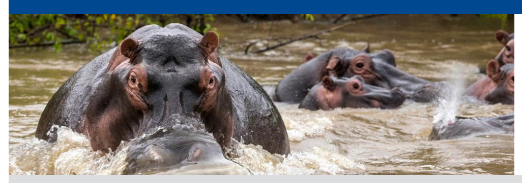
DEMOCRATIC REPUBLIC OFTHE CONGO (DRC) -2013: USAID's interventions in and around Virunga National Park are helping to protect the dwindling hippo populations.